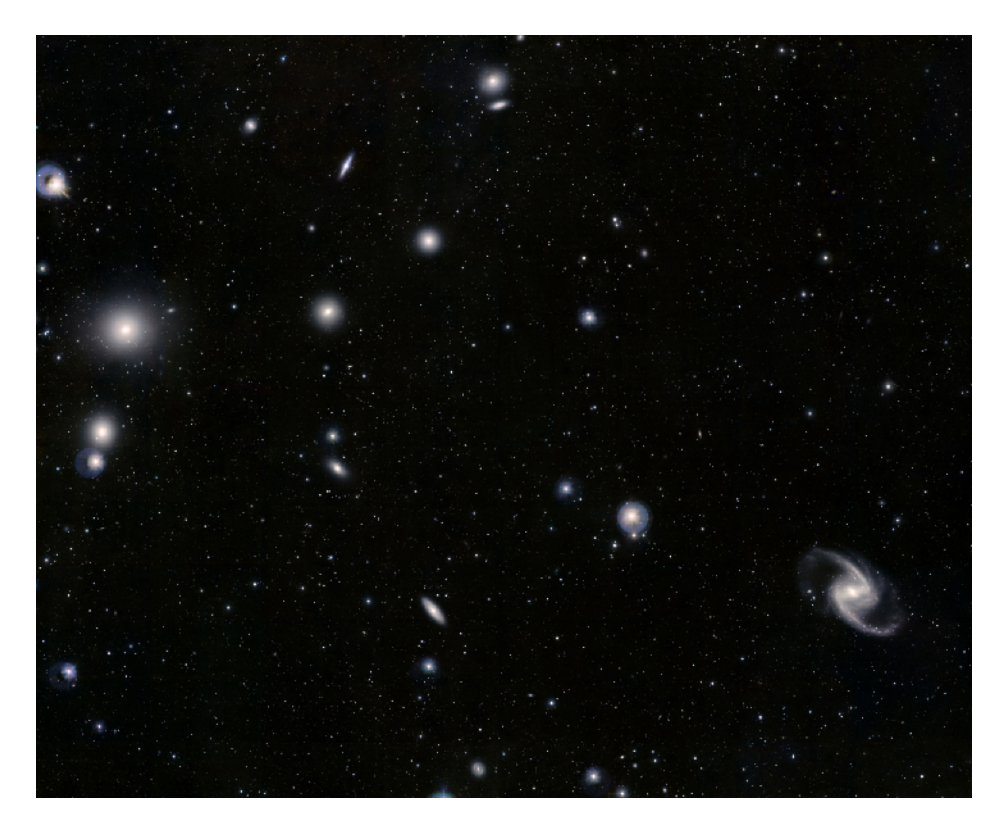
Figure 1.14 Fornax Cluster of Galaxies. In this image, you can see part of a cluster of galaxies located about 60 million light-years away in the constellation of Fornax. All the objects that are not pinpoints of light in the picture are galaxies of billions of stars.

Some of the clusters themselves form into larger groups called superclusters . The Local Group is part of a supercluster of galaxies, called the Virgo Supercluster, which stretches over a diameter of 110 million light-years. We are just beginning to explore the structure of the universe at these enormous scales and are already encountering some unexpected findings.