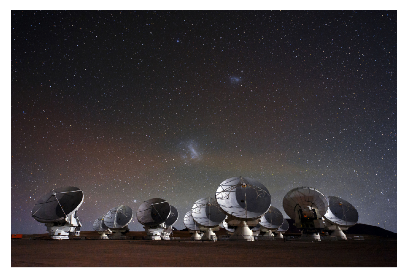
Figure 1.12 Neighbor Galaxies. This image shows both the Large Magellanic Cloud and the Small Magellanic Cloud above the telescopes of the Atacama Large Millimeter/Submillimeter Array (ALMA) in the Atacama Desert of northern Chile.

The nearest large galaxy is a spiral quite similar to our own, located in the constellation of Andromeda, and is thus called the Andromeda galaxy; it is also known by one of its catalog numbers, M31 (Figure 1.13). M31 is a little more than 2 million light-years away and, along with the Milky Way, is part of a small cluster of more than 50 galaxies referred to as the Local Group .